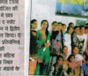
सहारनवास स्थित अमर सिंह कालेज में उपाधि प्राप्तकर्ता विद्यार्थियों के साथ प्राचार्य।