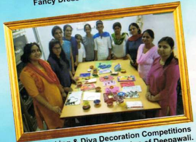
Card Making & Diya Decoration Competitions were organised on the occasion of Deepawali. Students prepared beautiful items using their creative and artistic skills.