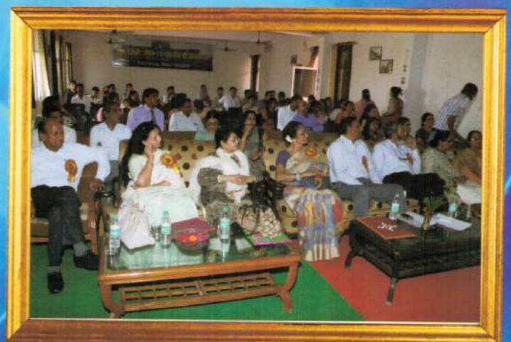
Guests and the teacher educators