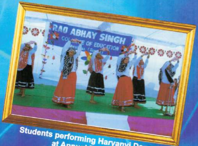
Students performing Haryanvi Dance at Annual Function