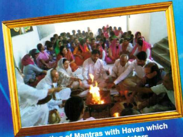
Chanting of Mantras with Havan which mesmerised the spectators