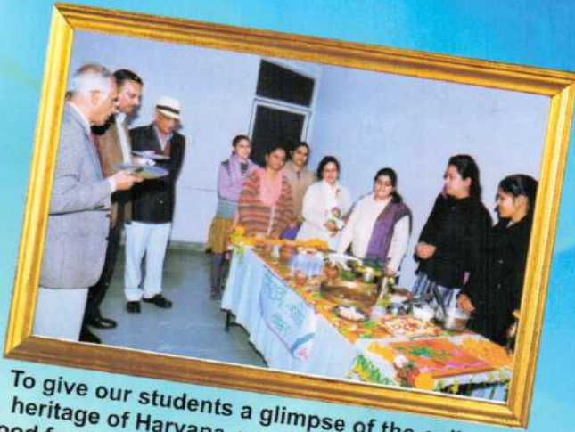
To give our students a glimpse of the culinary heritage of Haryana, we organised Haryanvi food festival. Army officers and other dignitaries were the guests on this occasion.