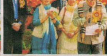
देवाड़ी, 20 फरवरी (अ.स.)

खेलकूद प्रतियोगिताओं के विजेता छात्र सम्मानित