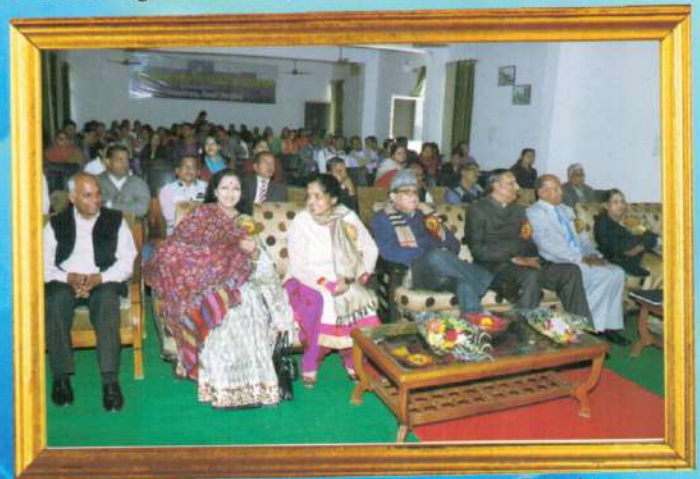
Guests and participating teacher educators