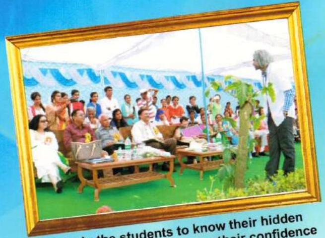
To help the students to know their hidden talents as well as to increase their confidence Fancy Dress Competition was organised.