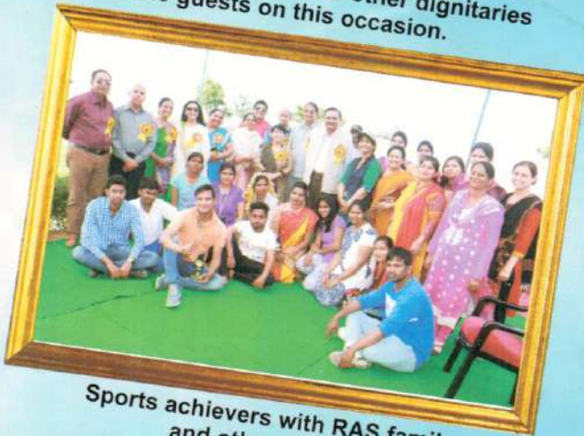
Sports achievers with RAS family and other guests.